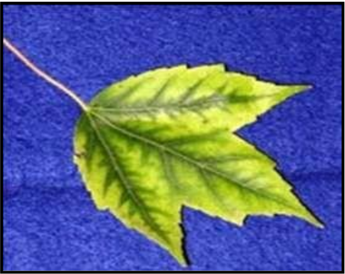
Manganese Deficiency in plant

9. Zinc (Zn): There is yellow stripping of the leaves between the veins. Older leavesdie, and plant is severally dwarfed.