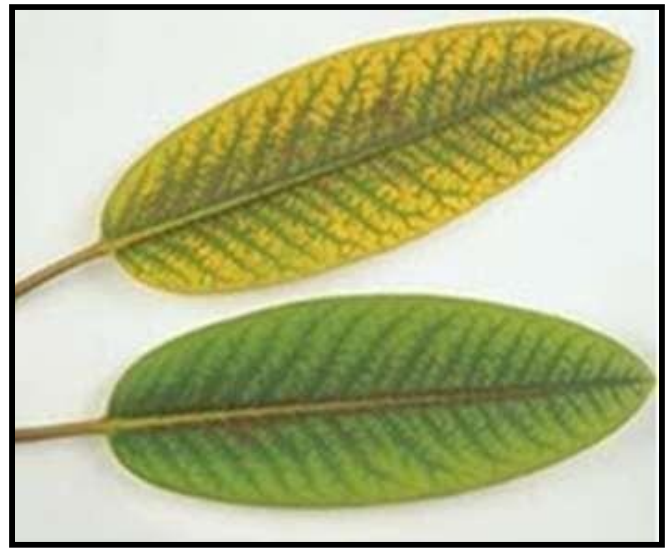
Phosphorous Deficiency in Plant

3. Potassium (K): Bottom leaves are scorched or burned on margins and tips. Leaves thicken and curl. Deficiency first develops in the wet portion of field.