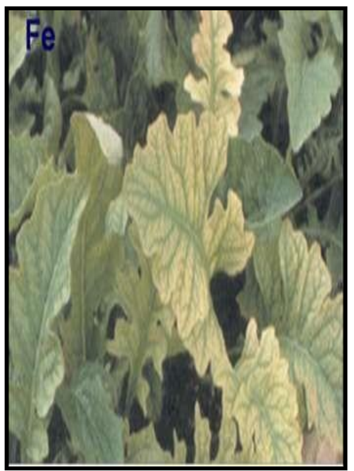
Iron Deficiency in Gerbera

8. Manganese (Mn): Spots of dead tissue scattered over young leaves. The smallest veins tend to remain green.