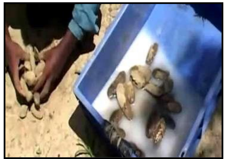
hot-water treatment, solar-heat treatment, etc. Chemical treatments include the use of fungicides and bactericides.

Seed treatment is of two types; viz., physical and chemical. Physical treatments include