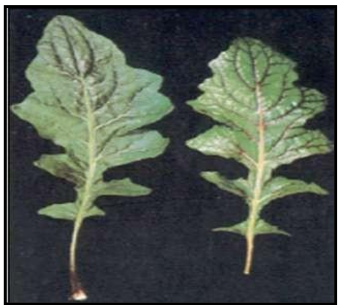
Sulphur Deficiency in Gerbera

7. Iron (Fe): Young leaves turn chlorotic. The main veins remain green. The stalk is short and slender. There is dieback of young growing tissues.