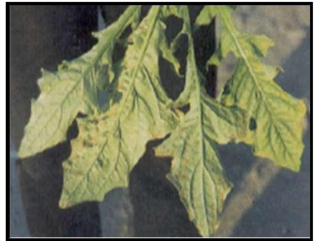
Calcium Deficiency in plant

5. Magnesium (Mg): There is general loss of green color starting with the bottom leaves and moving upward. Veins of the leaves remain green. In cotton the lower leaves turn purplish red with green veins.