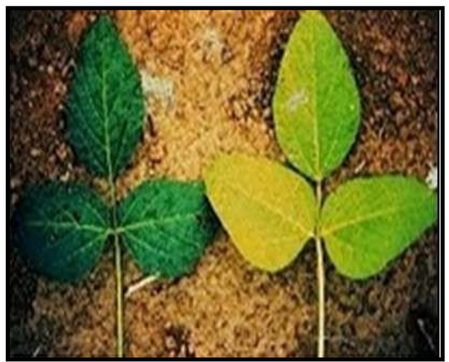
Healthy Leaf at Left side and Nitrogen Deficiency leaf at Right side

1. Nitrogen (N): Yellow or pale green color of leaves. Drying of bottom leaves and short plant height.