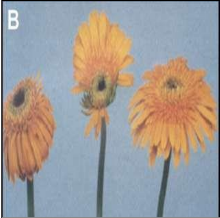
Boron Deficiency in Gerbera