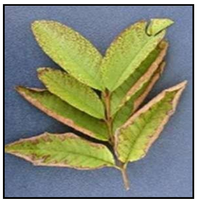
Potassium Deficiency in Plants

3. Potassium (K): Bottom leaves are scorched or burned on margins and tips. Leaves thicken and curl. Deficiency first develops in the wet portion of field.